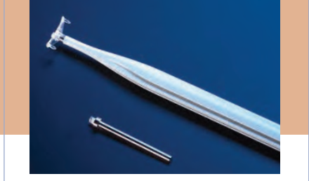
Each ENDOTINE TransBleph comes preloaded, ready for immediate placement.