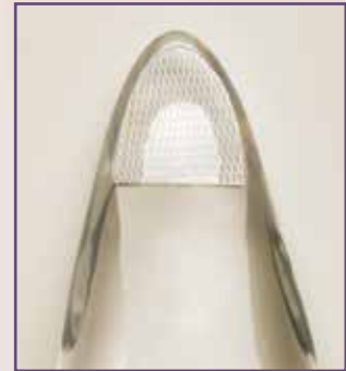
Pocket easing insertion

Our calf implants are sold sterile, single-use, by unit.